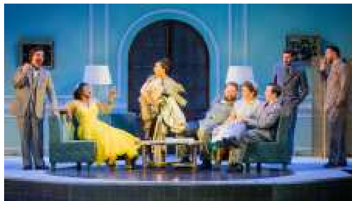
"La Rondine at Opera Holland Park" https://www.thetimes.co.uk

080804 M 2:30 - 4:30 pm Deghi 10/2 - 11/6 $100